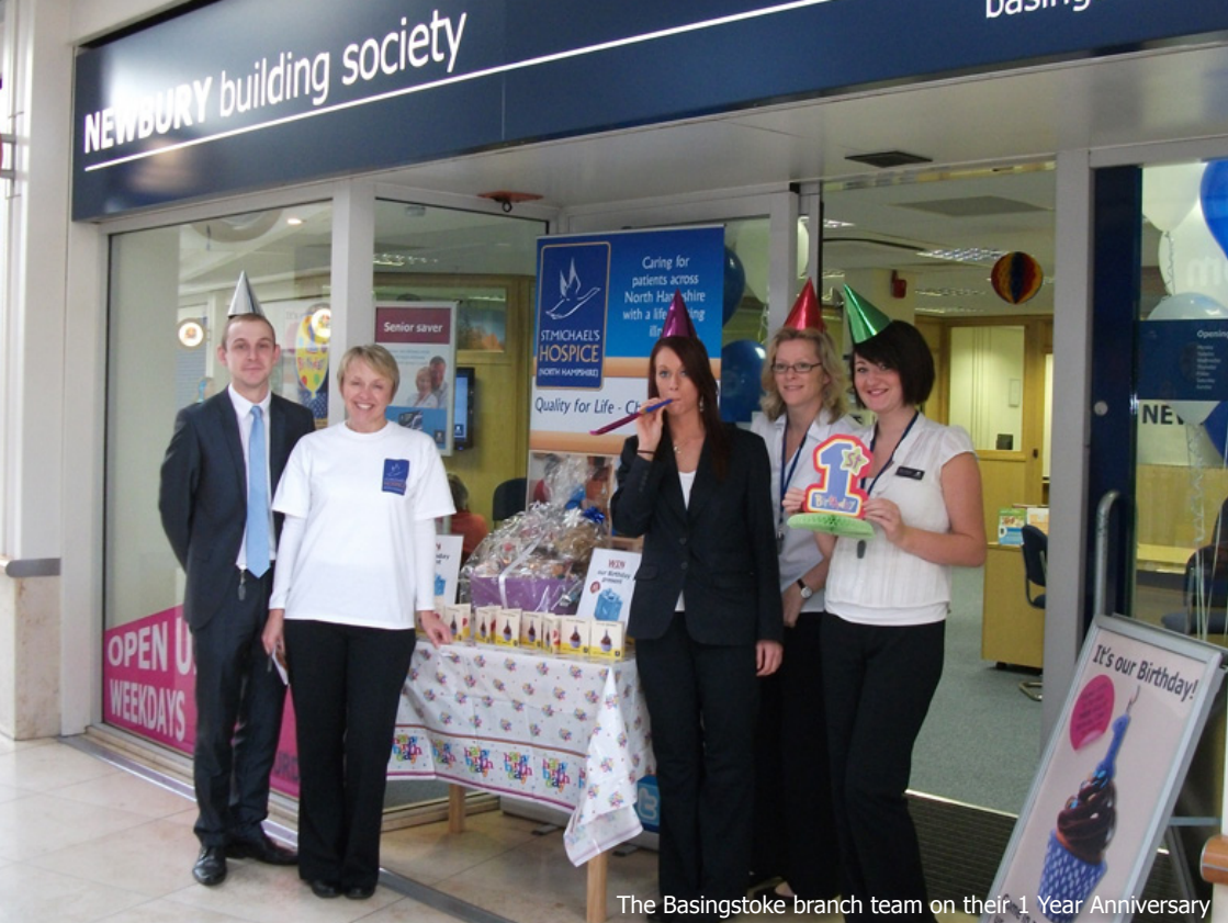
The Basingstoke branch team on their 1 Year Anniversary